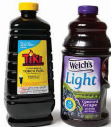
GRAPE JUICE TORCH FUEL