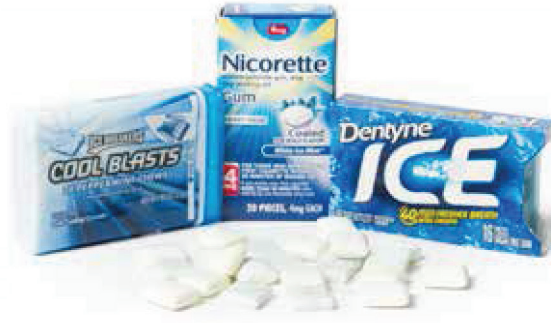
MINTS AND GUM NICOTINE GUM