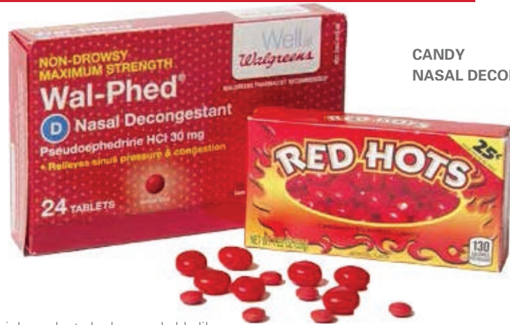
CANDY NASAL DECONGESTANT TABLETS

Many food, candy, and drink products look remarkably like some of these potentially harmful items. Use this brochure to educate your children (and yourself) about knowing the difference.