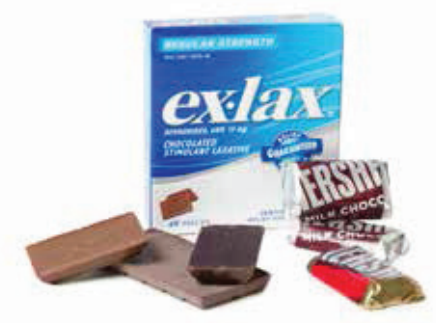
CHOCOLATE CANDIES CHOCOLATE LAXATIVES