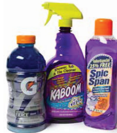
SPORTS DRINK CLEANING PRODUCTS