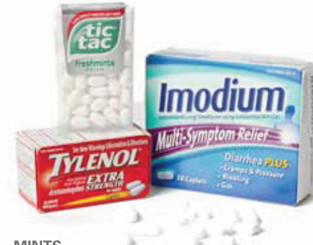
MINTS PAIN AND ANTI-DIARRHEA MEDICINE CAPLETS