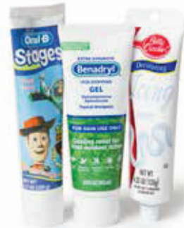
TOOTHPASTE AND ICING GEL ANTI-ITCH GEL