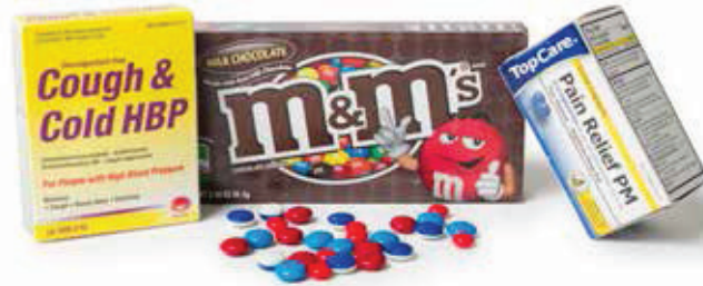
CHOCOLATE CANDIES PAIN RELIEVER MEDICINE AND COUGH AND COLD MEDICINE