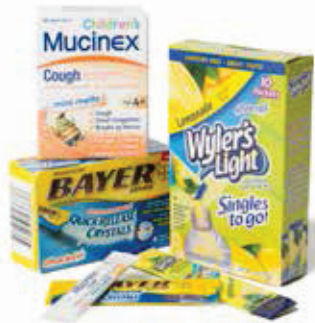
DRINK MIX POUCHES COUGH AND PAIN MEDICINE POUCHES