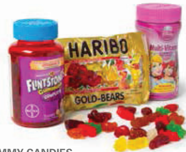
GUMMY CANDIES GUMMY VITAMINS