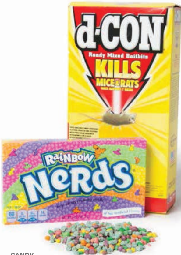
CANDY MICE AND RAT POISON