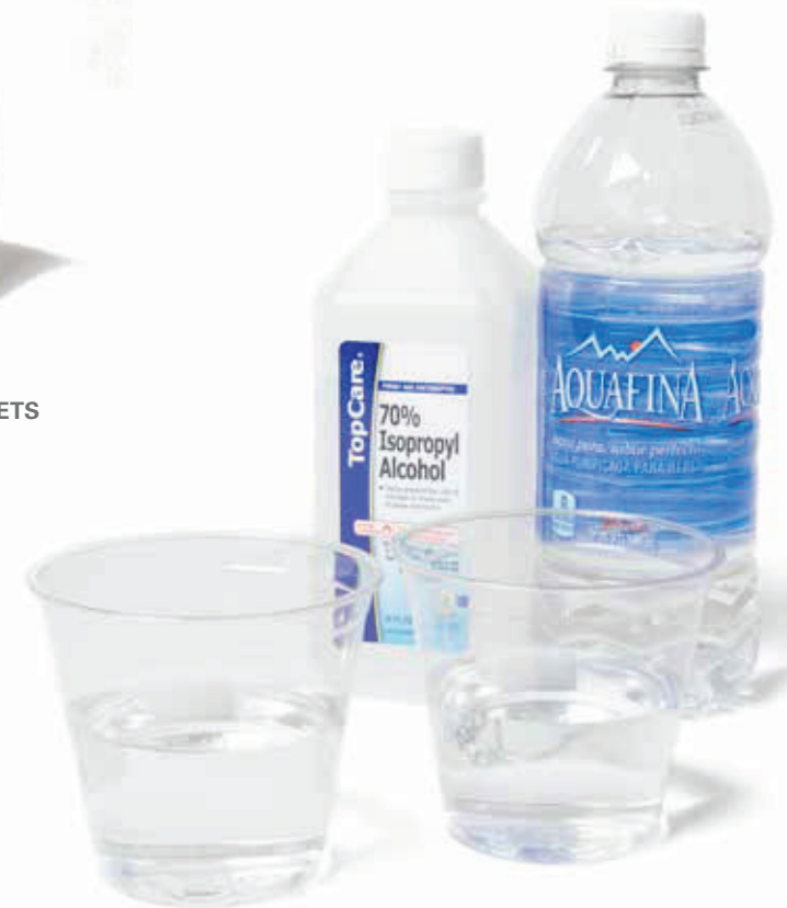
WATER RUBBING ALCOHOL