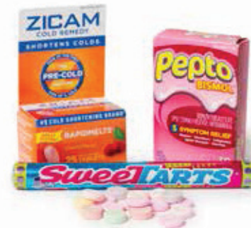
CANDY CHEWABLE MEDICINE TABLETS