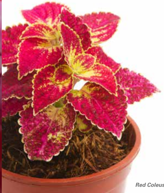
Red Coleus (Non-Toxic)