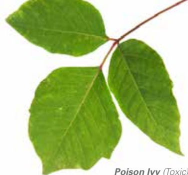
Poison Ivy (Toxic)