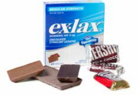
CHOCOLATE CANDIES CHOCOLATE LAXATIVES