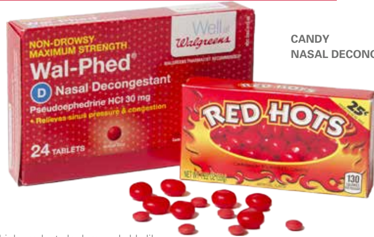
CANDY NASAL DECONGESTANT TABLETS

Many food, candy, and drink products look remarkably like some of these potentially harmful items. Use this brochure to educate your children (and yourself) about knowing the difference.