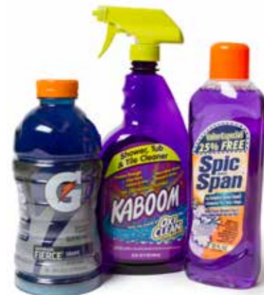
SPORTS DRINK CLEANING PRODUCTS