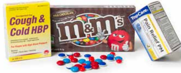
CHOCOLATE CANDIES PAIN RELIEVER MEDICINE AND COUGH AND COLD MEDICINE