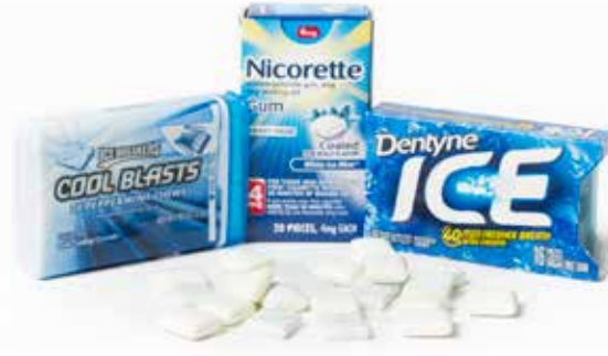
MINTS AND GUM NICOTINE GUM