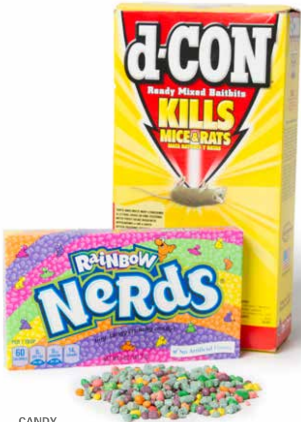
CANDY MICE AND RAT POISON