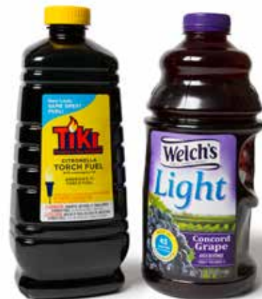
GRAPE JUICE TORCH FUEL