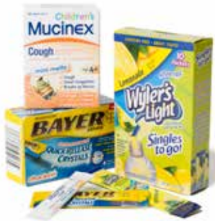
DRINK MIX POUCHES COUGH AND PAIN MEDICINE POUCHES