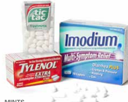
MINTS PAIN AND ANTI-DIARRHEA MEDICINE CAPLETS