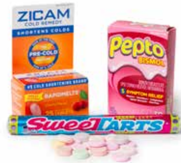
CANDY CHEWABLE MEDICINE TABLETS