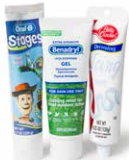
TOOTHPASTE AND ICING GEL ANTI-ITCH GEL