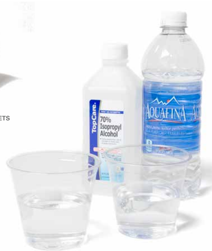
WATER RUBBING ALCOHOL