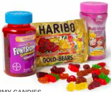
GUMMY CANDIES GUMMY VITAMINS